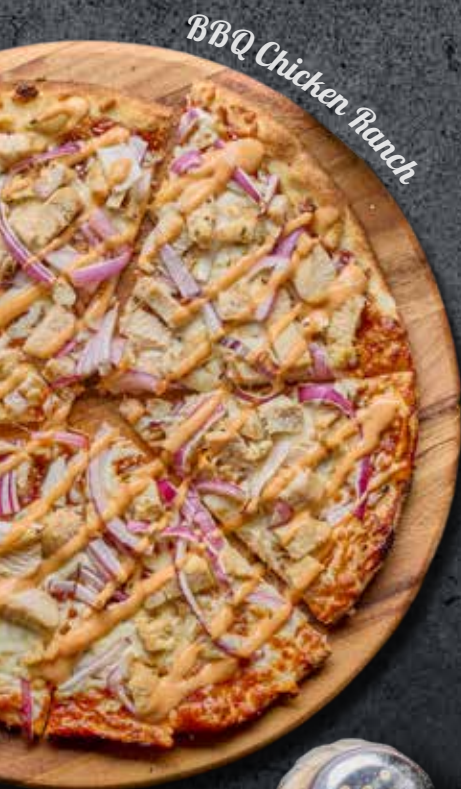
BBQ Chicken Ranch

Tomato sauce topped with pepperoni, bacon, salami & mozzarella | 20