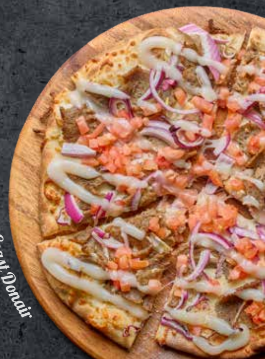
East Coast Donair